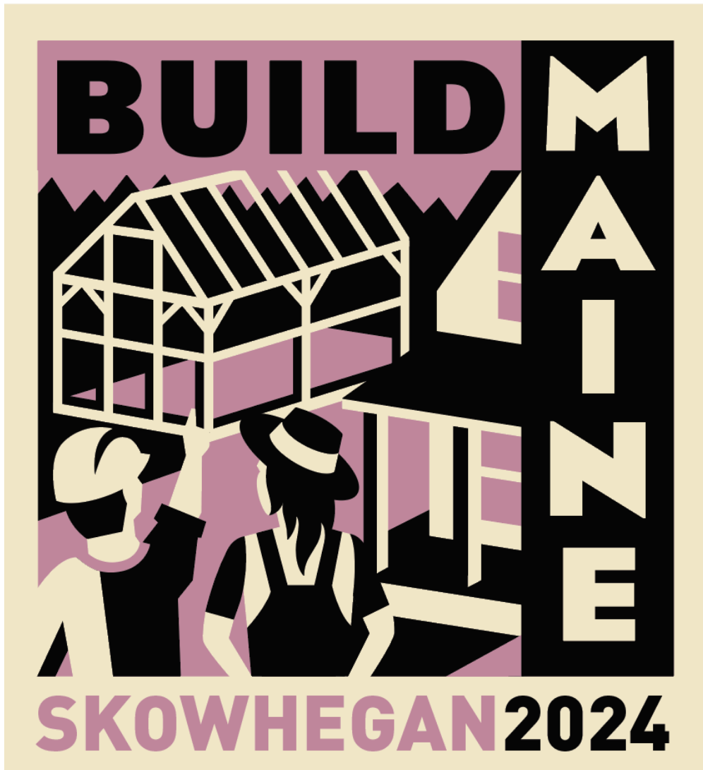
EXHIBIT & SPONSORSHIP OPPORTUNITIES

THE NEWSPAPER BUILDING 185 WATER STREET, SKOWHEGAN JUNE 5 + 6, 2024