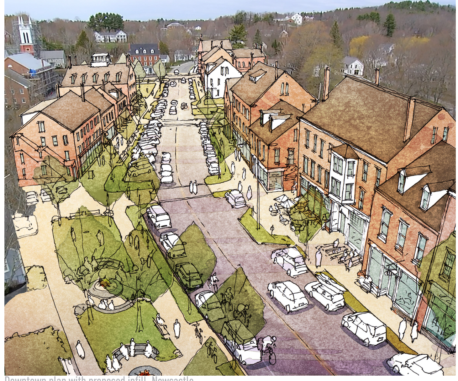
Downtown plan with proposed infill, Newcastle